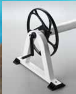
Platinum ST Roller