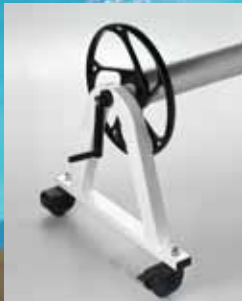
Platinum FM Roller